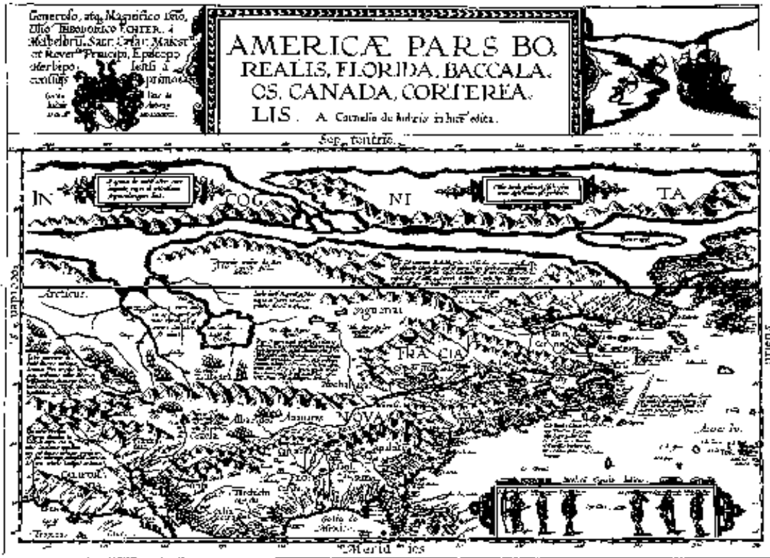
Fig. 2. Americae pars borealis by Cornelius Judaeus (1593). Parts of two of the four northern islands, labeled “[TERRA] INCOGNITA,” stretch across the top of the map.

The suggestion that there must be a large mountain of lodestone at the North Pole to account for the earth’s magnetism goes back to at least the 13th century, not long after the invention of the compass, 9 but what was the source of the four islands and the inward-